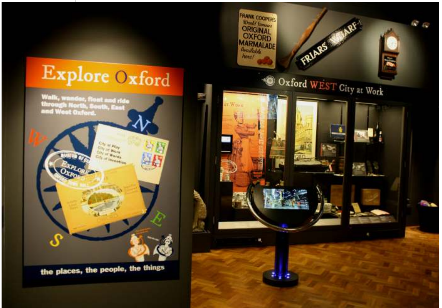
A rotating kiosk takes visitors on an exciting interactive ride through Oxford