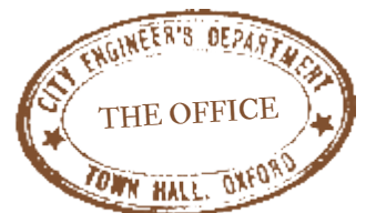
Explore the history of Oxford carefully filed away