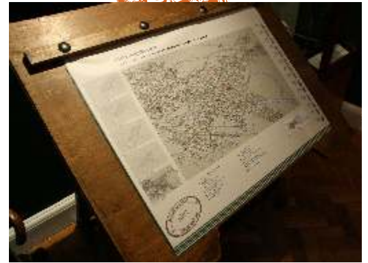
Five reconstructed views of Oxford for visitors to flip through