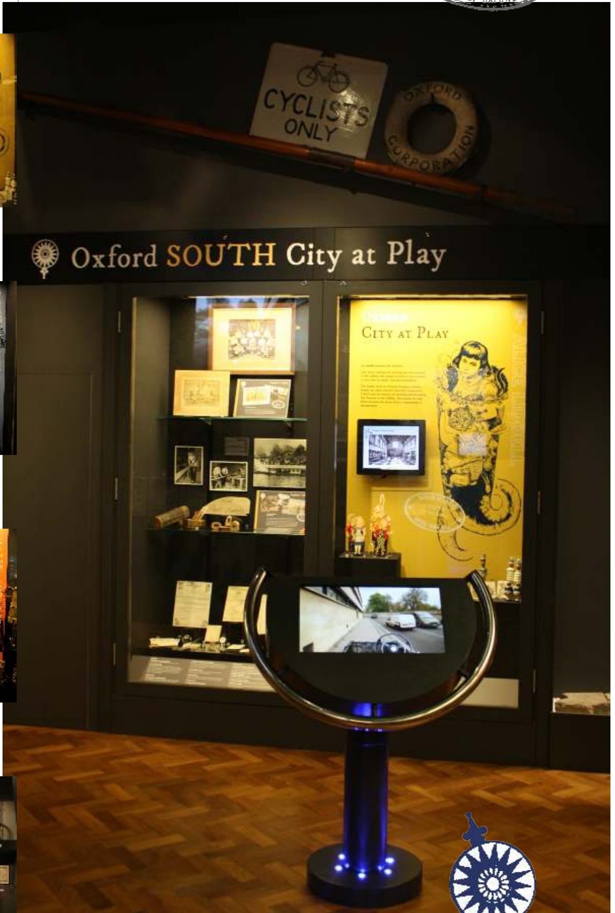
Gallery and all interpretation is set out to explore the four compass points of Oxford