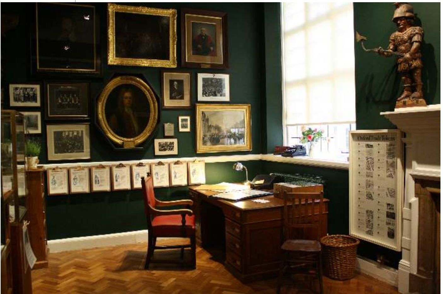
Oxford memories - in a talking drawer