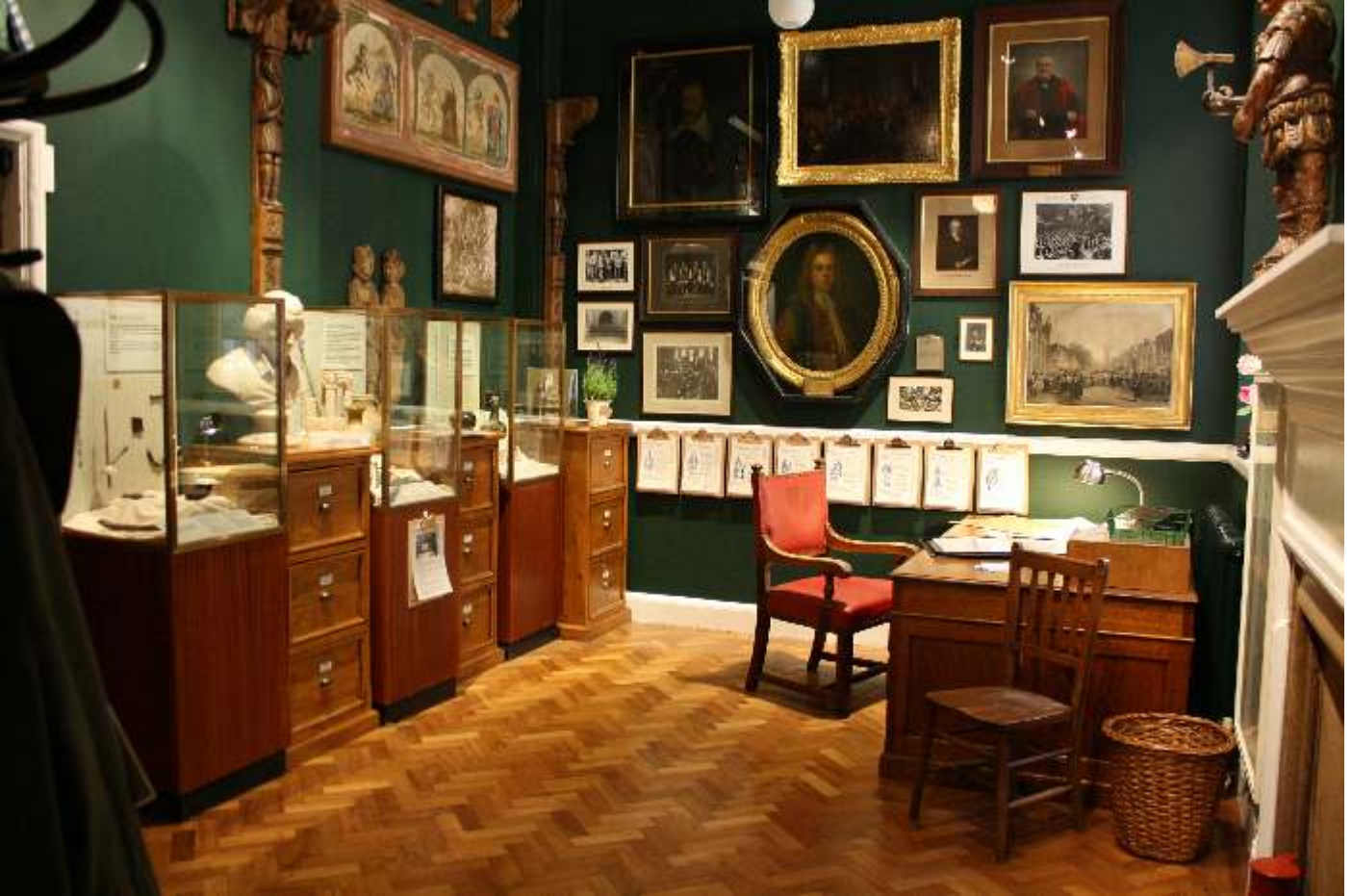
Reconstructed as the 1897 city engineers office - visitors trace the history of Oxford and the Town Hall