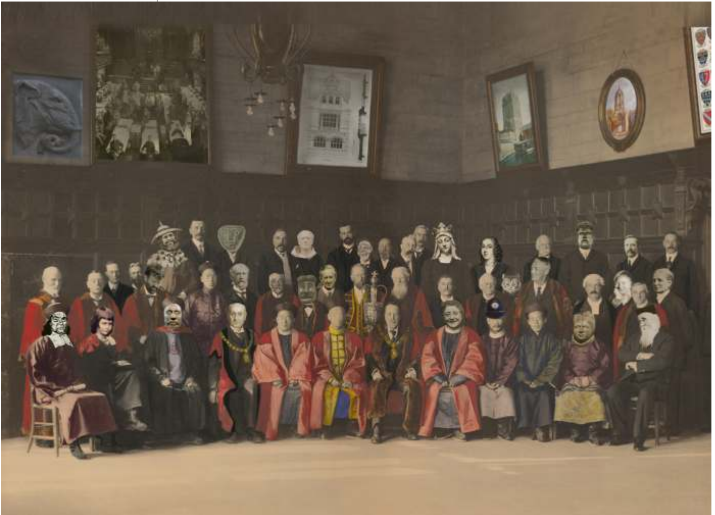
Introductory graphic adapted from an early Chinese Delegation visit photo - now incorporating the notable people and places & things of the city (Graphics - Perks Willis Design)