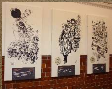
Oxford timeline